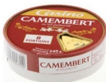
CASINO CAMEMBERT 8 PORTIONS 240G 379246 Family : MOLDED CHEESE Origin : France Fat: 20%