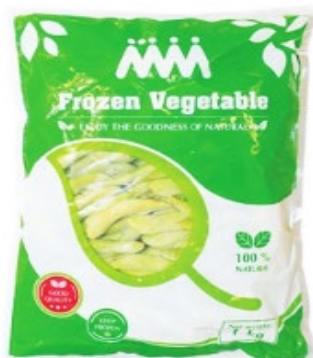
MM FROZEN ADAMAME 1KG 386065