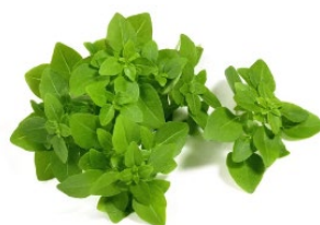
WAF GREEK BASIL 100G 335840