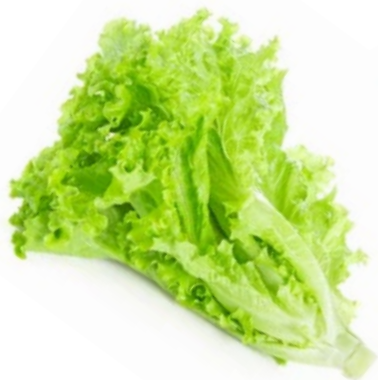
WAF LOLO GREEN