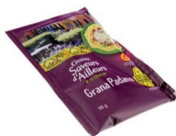
CASINO SA GRATED GRANA PADANO 90G 379243 Family : PRESSED CHEESE Origin : France Fat: 28%