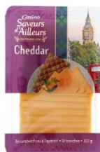
CASINO SA CHEDDAR SLICES 200G 388462 Family : FROMAGES CUISINE ET APERITIFS Origin : Scotland