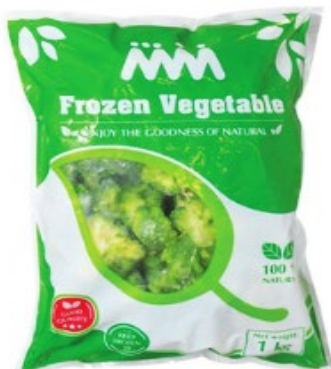
MM FROZEN BROCOLI 1KG 386066