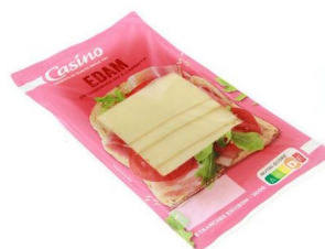
CASINO EDAM SLICES 200G 388459 Family : COOKING CHEESE Origin : France Fat: 24%