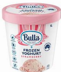
BULLA STRAWBERRY FROZEN YOGHURT 1L 333369 Packing: 1L/tub

Our dairy industry is one of the highest regulated food industries with three levels of government regulation – national, state and local. Food safety and quality is one of our top priorities, providing consumers with complete trust in every product we produce.