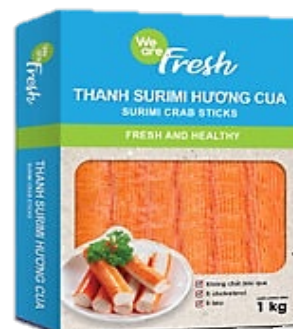
WAF CRAB STICK 500G | 1KG 414080 | 414083