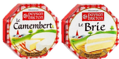
PAYSAN BRETON CAMEMBERT 125G 208535