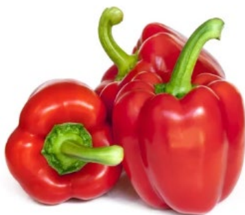
WAF CAPSICUM RED 800G 336534