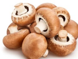
WAF BROWN BUTTON MUSHROOM 200G 398905