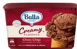
BULLA CREAMY CLASSIC CHOCOCCHIPC ICE CREAM 2L 90122 Packing: 2L/tub