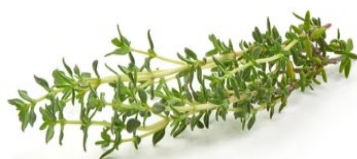
WAF THYME 150G| 100G 357119 | 335823