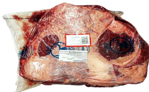
CHILLED BEEF WHOLE RUMP *A* 62493