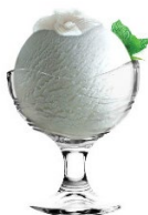
CREMO COCONUT ICE CREAM 6L 200063 Packing: 6L/tub