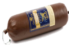
GRAND'OR SMOKED CHEESE 200G 170498