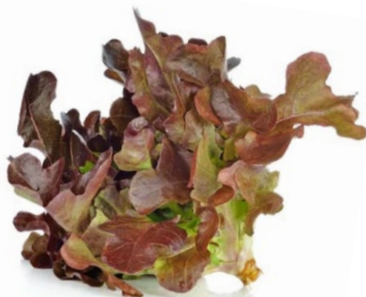
WAF OAKLEAF RED