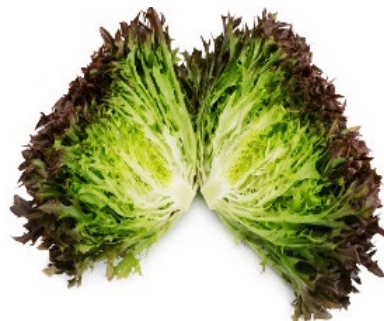
WAF SALANOVA CRISP RED 335849 | HYDROPONIC