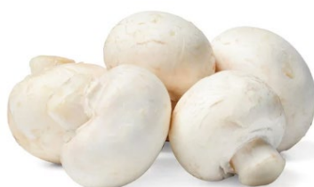
WAF WHITE BUTTON MUSHROOM 200G 398904