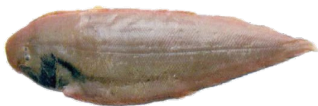
TONGUE SOLE FISH 10-20 PCS/KG 174395