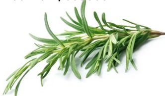
WAF ROSEMARY 150G| 100G 357158 | 336518