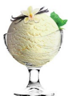
CREMO VANILLA ICE CREAM 6L 200061 Packing: 6L/tub

Our products have been exported to more than 15 countries on 4 continents around the world with certifications from the Department of Livestock Development, Ministry of Commerce, Thai Halal Standards Institute and certificates from HACCP, GMP, ISO22000..