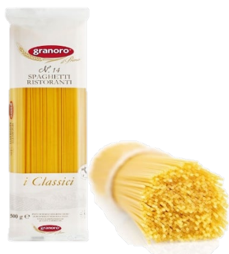
GRANORO – I CLASSICI N.14 SPAGHETTI RISTORANTI 182951