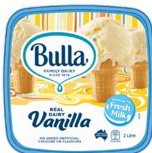
BULLA VANILLA ICE CREAM 2L 90126 Packing: 2L/tub