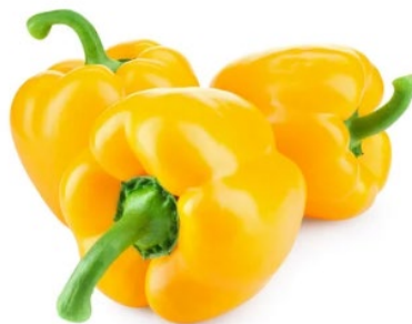
WAF CAPSICUM YELLOW 800G 336536