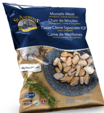
CHILEAN MUSSEL MEAT 1KG 424003 | size 300-500 424000 | size 100-200