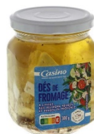
CASINO CHEESE CUBES IN OIL 300G JAR 388466 Family : COOKING CHEESE Origin : France