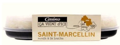
CASINO CVI SAINT MARCELLIN 2X80G 388440 Family : MOLDED CHEESE Origin : France Fat: 22%