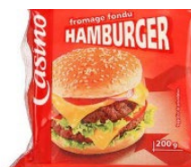
CASINO HAMBURGER x10 200G 379234 Family : FROMAGES CUISINE ET APERITIFS Origin : France