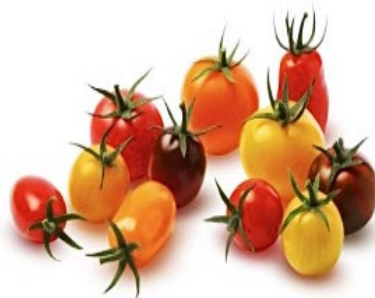
WAF TOMATO CHERRY MIXED COLOR 500G 336356