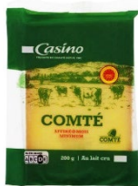
CASINO COMTE 6 MOIS 200G CO 379247 Family : PRESSED CHEESE Origin : France