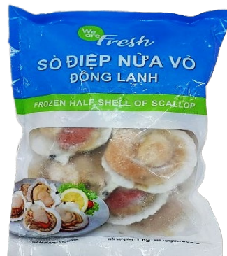
WAF HALF SHELL SCALLOP 1KG 408542 | 60% 408543 | 80%