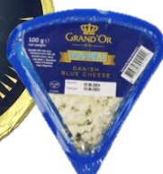
GRAND'OR DANISH BLUE CHEESE 100G 322928