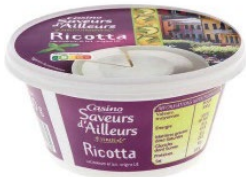
CASINO SA RICOTTA 250G 379222 Family : SEASON CHEESE Origin : Italy