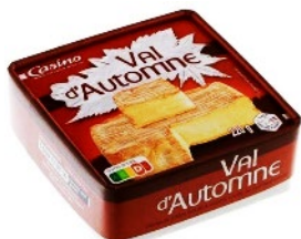
CASINO VAL AUTOMNE CO 220G 388438 Family : FROMAGES A PATE MOLLE Origin : France Fat: 27%