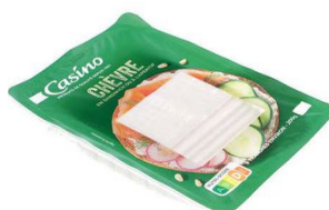
CASINO CHEVRE SLICES 200G 388461 Family : FROMAGES CUISINE ET APERITIFS Origin : Belgium