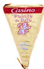
CASINO PIECE OF BRIE 200G 379256 Family : MOLDED CHEESE Origin : France Fat: 32%