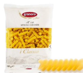
GRANORO I CLASSICI N.100 SPIRALI GRANDI 182933