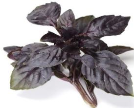
WAF PURPLE BASIL 150G| 100G 357125 | 335822