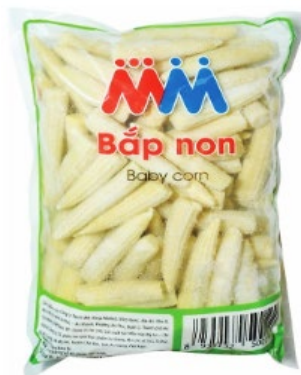
MM FROZEN BABY CORN 1KG 303930