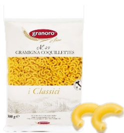
GRANORO I CLASSICI N.49 GRAMIGNA COQUILLETES 182930