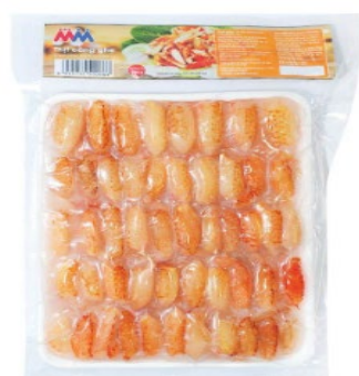
MM BLUE CRAB BIG CLAW MEAT 500G 258243