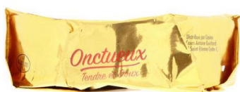
CASINO UNCTUOUS CHEESE 250G 388438 Family : MOLDED CHEESE Origin : France