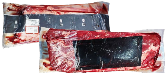
CHILLED BEEF STRIPLOIN *YG* 330513