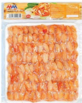
MM BLUE CRAB SMALL CLAW MEAT 500G 258262

We Are Fresh crab sticks contain 54% marine fish Surimi content. Has real toughness and elasticity, the fibers separate completely but each fiber still retains its elasticity, does not separate when left in soup or hotpot.