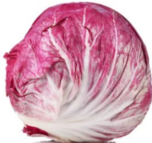
WAF RADICHIO 335867 | SOIL