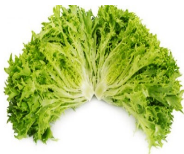
WAF SALANOVA CRISP GREEN 335848 | HYDROPONIC