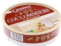
CASINO COULOMMIERS 320G 379252 Family : MOLDED CHEESE Origin : France Fat: 24%