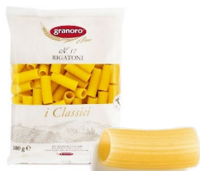
GRANORO I CLASSICI N.17 RIGATONI 182932