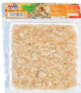
MM BLUE CRAB BODY MEAT 500G 258250