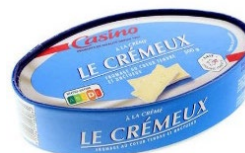
CASINO OVALE CREMEUX 200G 388442 Family : FROMAGES A PATE MOLLE Origin : France Fat: 60%