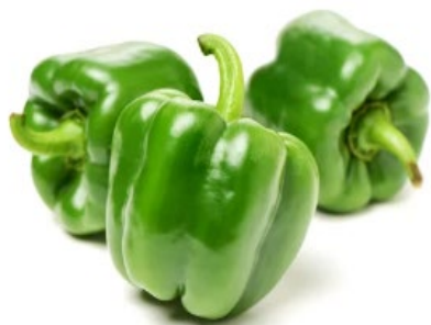
WAF CAPSICUM GREEN 800G 336538