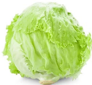
WAF ICEBERG 336375 | SOIL 335834 | HYDROPONIC