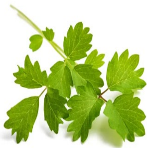
WAF BURNET 50G | 100G 357254 | 335831