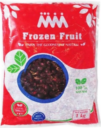
WAF FROZEN RASPBERRY 1KG 386068