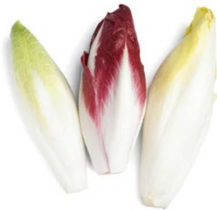
WAF ENDIVE WHITE | RED 387432 | 387435