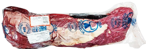
CHILLED BEEF TENDERLOIN *A* 349272