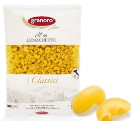
GRANORO I CLASSICI N.66 LUMACHETTE 182936