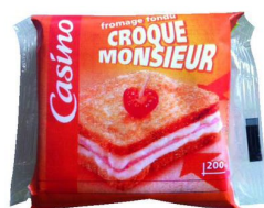
CASINO CROQUE MONSIEUR x10 200G 388440 Family : FROMAGES CUISINE ET APERITIFS Origin : France