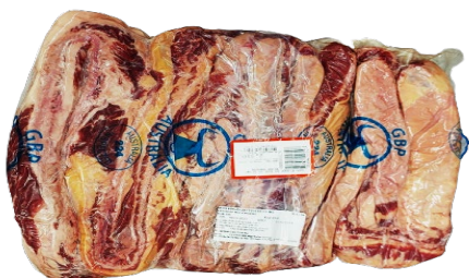
CHILLED BEEF RIB FINGER *A* 349273