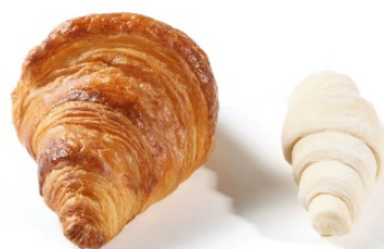
BUTTER CROISSANT 70G 409484 Packing: 25 pcs/box