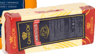
GRAND'OR GOUDA CHEESE BLOCK 248838