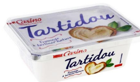
CASINO ARTIDOU CHEESE SPREAD 300G 388468 Family : FROMAGES CUISINE ET APERITIFS Origin : Danemark Fat: 24%