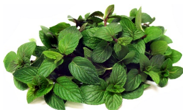
WAF CHOCO MINT 150G| 100G 357160 | 322097