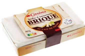
CASINO BRIQUE VACHE 200G 379259 Family : MOLDED CHEESE Origin : France Fat: 32%