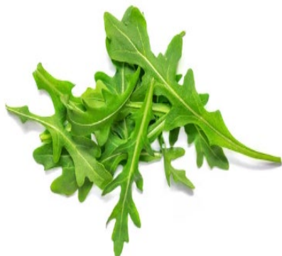
WAF ROCKET 50G | 100G 357251 | 335829