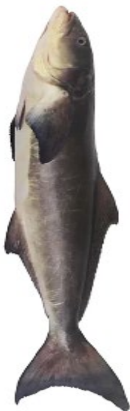
WHOLE COBIA 174376 | 1.0-5.0 KG 174377 | 5.0-10.0 KG