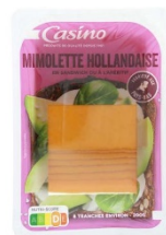
CASINO MIMOLET HOLL SLICES 200G 388460 Family : FROMAGES CUISINE ET APERITIFS Origin : Netherlands