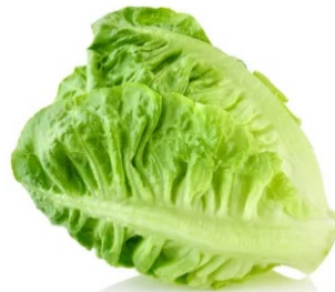
WAF MINI COS 335867 | HYDROPONIC