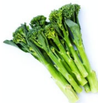
WAF BABY BROCOLI 300G 383561