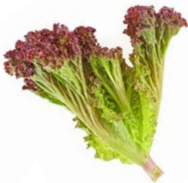
WAF LOLO ROSA