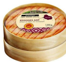
CASINO CVI EPOISSES 250G 388443 Family : MOLDED CHEESE Origin : France