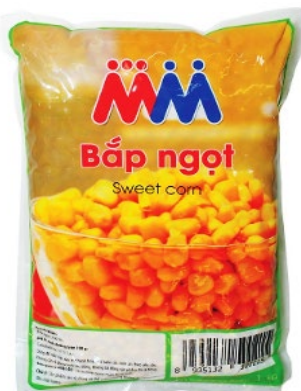
MM FROZEN SWEET CORN 1KG 258969