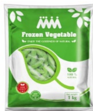
MM FROZEN SNOW BEAN 1KG 383561