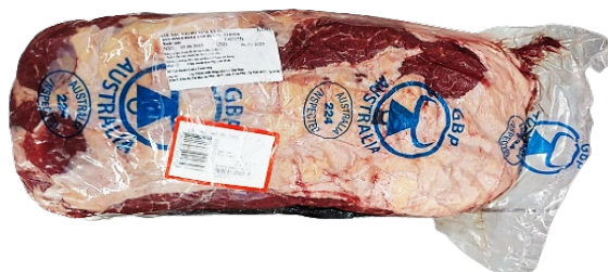
CHILLED BEEF TOP BLADE *A* 321011