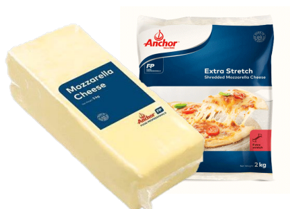
ANCHOR MOZZARELLA CHEESE SHREDDED 2KG 404819