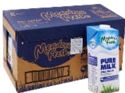
MEADOW FRESH FULL CREAM MILK 1L | 12x1L 349686 | 351039 Origin: New Zealand