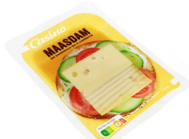
CASINO MAASDAM HOLL SLICES 200G 388457 Family : FROMAGES CUISINE ET APERITIFS Origin : Netherlands