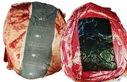
CHILLED BEEF WHOLE RUMP *YG* 157379