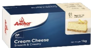
ANCHOR CREAM CHEESE 1L 6686