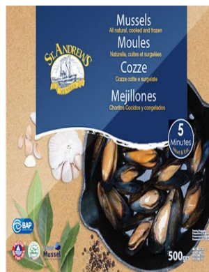
CHILEAN WHOLE SHELL MUSSELS 1KG 424004

Our Chilean Mussel are cultivated in the pristine waters of the Chilean Patagonia. Growing in these biologically diverse and nutrient-rich waters, our mussels acquire a unique taste. Our harvesting process ensures that these flavour qualities are captured, allowing us to share them with consumers around the world.