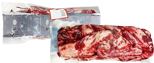
CHILLED BEEF RIB FINGER *YG* 219397