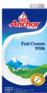
ANCHOR FULL CREAM MILK 1L 105039 Origin: New Zealand