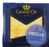
GRAND'OR CHEEDDA SLICED 200G WHITE | COLOR 259473 | 259474