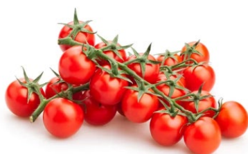
WAF TOMATO CHERRY 500G 383558