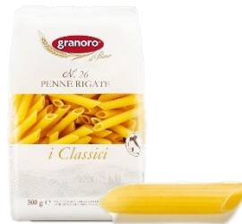
GRANORO I CLASSICI N.26 PENNE RIGATE 182931