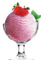
CREMO STRAWBERRY ICE CREAM 6L 354921 Packing: 6L/tub