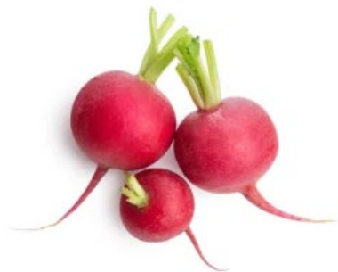
WAF RED RADISH 500G 398913