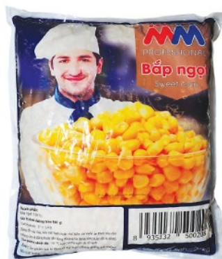
MM PRO FROZEN SWEET CORN 2KG 258982