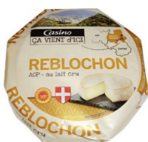
CASINO CVI REBLOCHON 450G 379251 Family : MOLDED CHEESE Origin : France Fat: 28%