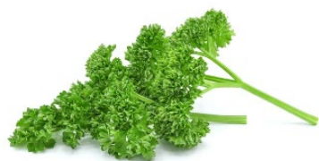
WAF CURLY PARSLEY 150G| 100G 357152 | 148795