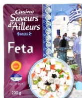
CASINO SA FETA CHEESE 200G 382746 Family : SEASON CHEESE Origin : Grecia Fat: 24%