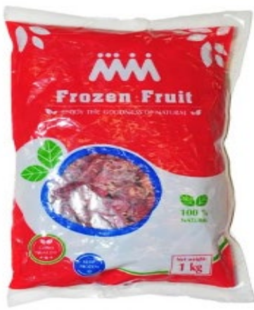
WAF FROZEN BLUEBERRY 1KG 386069