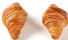
BUTTER CROISSANT 30G 409494 Packing: 80 pcs/box