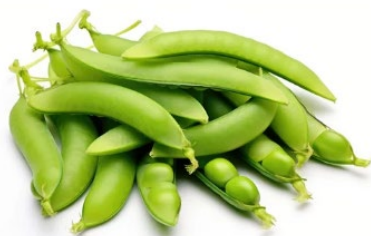
WAF SNOW BEAN 200G 336891