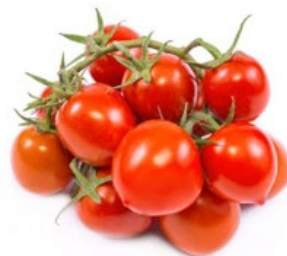
WAF TOMATO ROSEBERRY 500G 383559