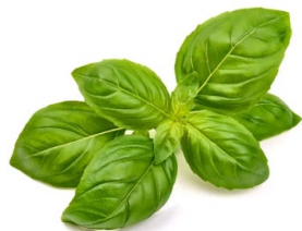
WAF SWEET BASIL 150G| 100G 357147 | 336880