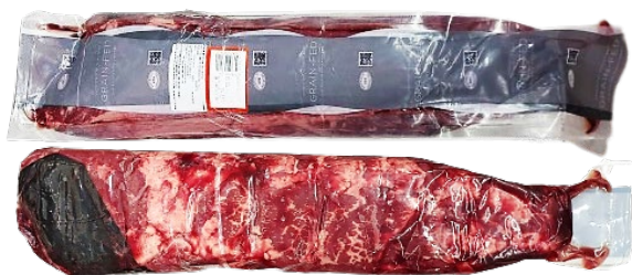
CHILLED BEEF TENDERLOIN *YG* 104563