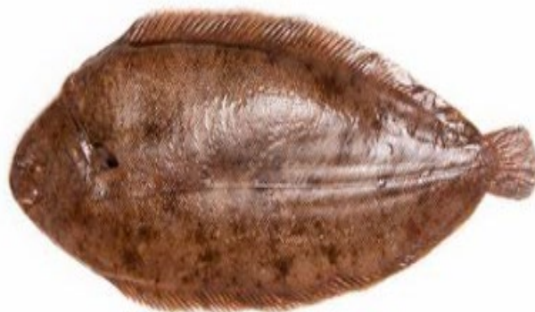
DOVER SOLE (KOREAN) 1.0-3.0 KG 307397