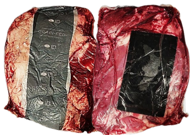
CHILLED BEEF TOPSIDE *YG* 143245