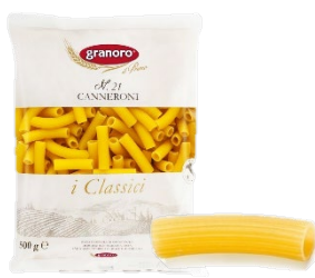
GRANORO I CLASSICI N.21 CANNERONI 182929