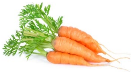
WAF BABY CARROT 300G 398903