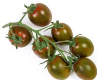
WAF TOMATO CHERRY CHOCOLATE 500G 383560