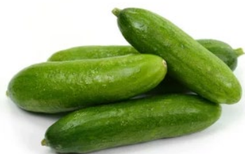
WAF BABY CUCUMBER 500G 336541