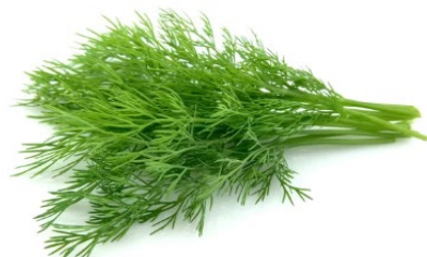
WAF DILL 150G| 100G 357140 | 335825