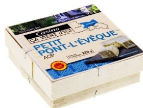
CASINO CVI PETIT PONT LEVEQUE 220G 379250 Family : MOLDED CHEESE Origin : France