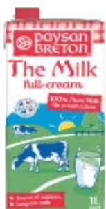
PAYSAN BRETON FULL CREAM MILK 1L 400414 Origin: France