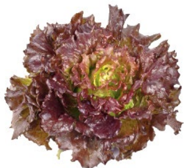
WAF BATAVIA RED 335820 | HYDROPONIC