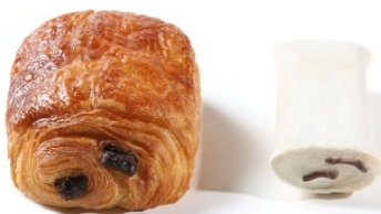
CHOCOLATE BUTTER CROISSANT 70G 409491 Packing: 30 pcs/box