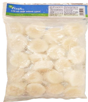
WAF SCALLOP MEAT 70% 1KG 408540

Our quality check (inspection) system is using the latest technologies; providing you an accurate report to help you to take the RIGHT decision before buying the product.