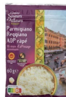
CASINO GRATED PARMIGIANO 60G 388451 Family : PRESSED CHEESE Origin : Italy Fat: 29%