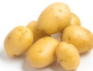
WAF BABY POTATO 1KG 398911