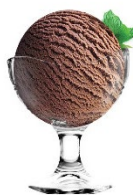
CREMO CHOCOLATE ICE CREAM 6L 354915 Packing: 6L/tub