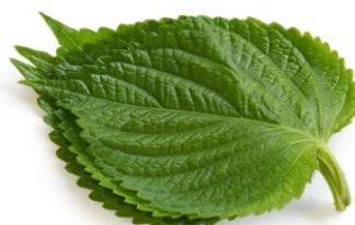
WAF GREEN PERILLA LEAF 100G 398914