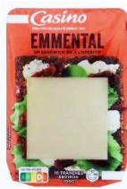
CASINO EMMENTAL CHEESE SLICES 200G 388458 Family : COOKING CHEESE Origin : France