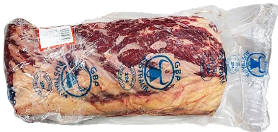
CHILLED BEEF RIB EYE *A* 36201