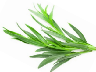
WAF TARRAGON 150G| 100G 357249 | 335828