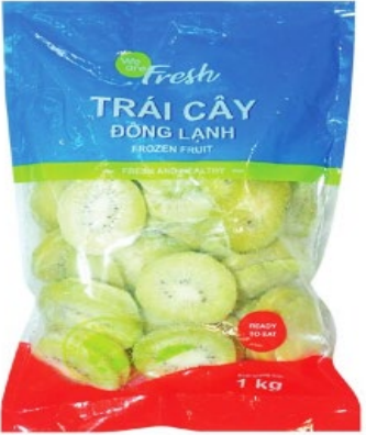
WAF FROZEN KIWI 1KG DICED | SLICED 430528 | 430529