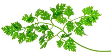
WAF CHERVIL 150G| 100G 357264 | 335850