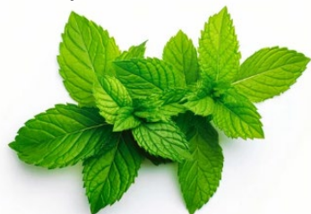
WAF PEPPER MINT 150G| 100G 357138 | 335819