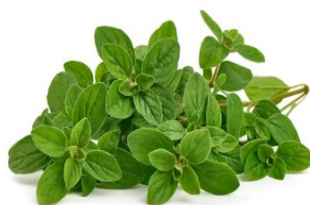
WAF MARJORAM 150G| 100G 357120 | 335821