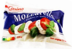
CASINO FRESH MOZZARELLA 125G 379224 Family : SEASON CHEESE Origin : Italy