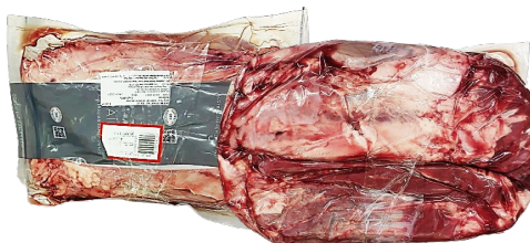
CHILLED BEEF SHIN TRIM HAM *YG* 141195