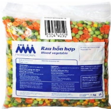
MM PRO FROZEN MIXED VEGETABLE 304405 | 1KG 415142 | 2KG