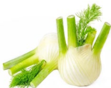
WAF FENNEL 398916