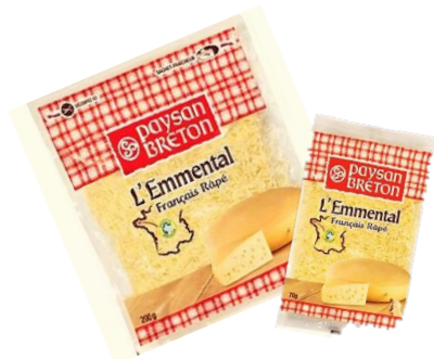
PAYSAN BRETON SHREDDED EMMENTAL 70G | 200G 352611 | 165529