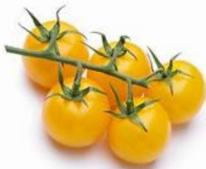
WAF TOMATO CHERRY YELLOW 500G 336352