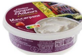
CASINO SA MASCARPONE 250G 379227 Family : COOKING CHEESE Origin : Italy Fat: 48%