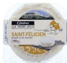
CASINO CVI SAINT FELICIEN 180G 388439 Family : MOLDED CHEESE Origin : France Fat: 29%