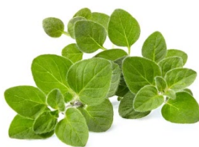
WAF OREGANO 150G| 100G 357161 | 335827