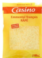
CASINO GRATED EMMENTAL 100G 381086 Family : PRESSED CHEESE Origin : France Fat: 29%