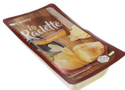
CASINO RACLETTE 400G 389394 Family : SEASON CHEESE Origin : France Fat: 26%