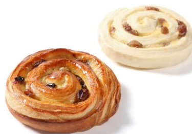
SULTANA BUTTER SWIRL 90G 409493 Packing: 25 pcs/box