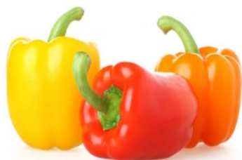
WAF CAPSICUM 3 COLOR 500G 336528