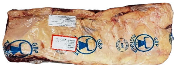
CHILLED BEEF STRIPLOIN *A* 249463