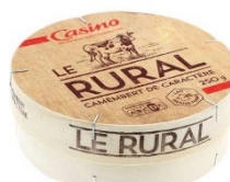
CASINO CAMEMBERT LE RURAL 250G 379245 Family : MOLDED CHEESE Origin : France