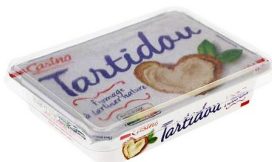
CASINO TARTIDOU NATURE 150G 395695 Family : FROMAGES CUISINE ET APERITIFS Origin : Danemark Fat: 24%