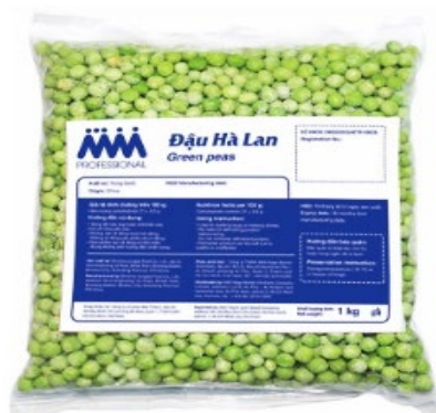
MM PRO FROZEN GREEN PEA 304407 | 1KG 304409 | 2KG