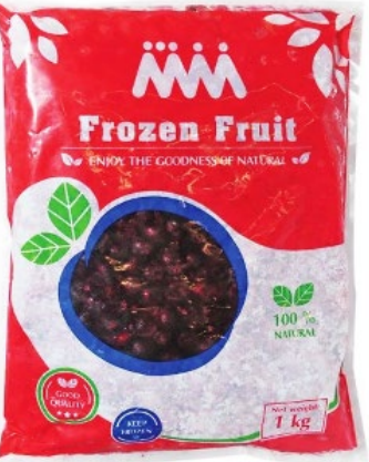
WAF FROZEN STRAWBERRY 1KG 395278