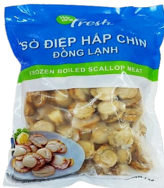
WAF STEAMED SCALLOP 1KG 408544 | 60-80 PCS 408546 | 80-100 PCS