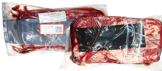
CHILLED BEEF RIB EYE *YG* 106052