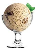
CREMO RUM & RAISIN ICE CREAM 6L 200064 Packing: 6L/tub