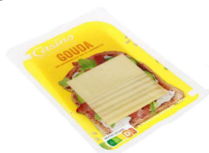
CASINO GOUDA SLICES 200G 388456 Family : COOKING CHEESE Origin : Netherlands