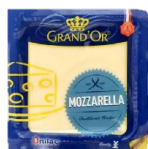
GRAND'OR MOZZARELLA CHEESE 200G | KG 259472 | 259482