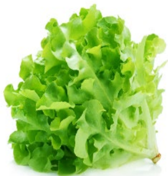
WAF OAKLEAF GREEN