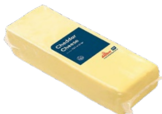
ANCHOR CHEDDA CHEESE BLOCK 2KG 6689