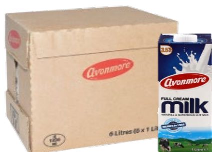
AVONMORE FULL CREAM MILK 1L | 6x1L 342930 | 406666 Origin: Ireland