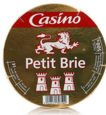
CASINO PETIT BRIE 500G 379249 Family : MOLDED CHEESE Origin : France Fat: 28%