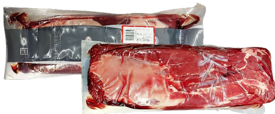
CHILLED BEEF TOP BLADE *YG* 332490