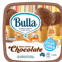
BULLA CHOCOLATE ICE CREAM 2L 90128 Packing: 2L/tub